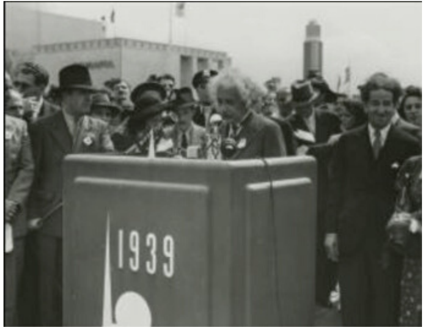
Albert Einstein issues a challenge to science as he opens the 1939 World's Fair.

Among the many untold stories are the lived experiences in the labs and facilities where basic scientists are giving everything they have, and more, toward the effort to understand and combat SARS-CoV-2.